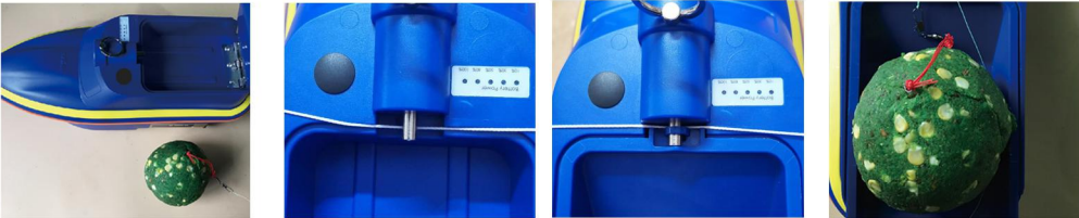
Press the switch of hopper for 3 seconds to open the hopper

When using semilyh and explosive hook,it needs hopper,as below show: